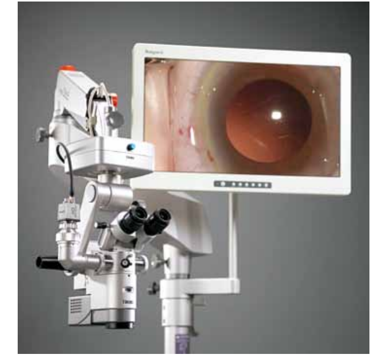
\mbox{\ensuremath{^{\ast}}} The above image on the monitor is created by inlay. An actual image may be different from it.